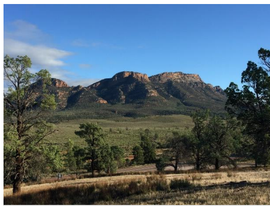
View of Rawnsley Bluff, Flinders Ranges